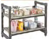
Shown with optional 2mm heavy-duty casters.