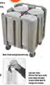
Black with standard plate rack only.

The Compact Adjustable Dish Caddy offers big value in a smaller footprint without compromising performance, storage capacity or load bearing. Ideal for large or small events, lightweight, easy to maneuver, with access from all four sides. Choose from 4, 8 or 12 tower models to accommodate various plate sizes. Caddy holds up to 240 each 12" (30 cm) plates, (up to 72 per column).* Overall dimensions: 27" x 27" x 21 1/2" (68.6 x 68.6 x 54.3 cm). Single body, made of smooth, highly durable, easy-to-clean plastic. Patent Pending Load-over Tower easily adjusts from the top. Four (4) each 5 1/2" (13.9 cm) size plated casters, all swivel with brake, with non-marking, highly durable TPE tread. Includes weight cones with 2" x 5" (5.1 x 12.7 cm) secondary and/or wheel identification pocket on top. Color: Specified Gray (180). *Holding capacity based on plate size and drying design.